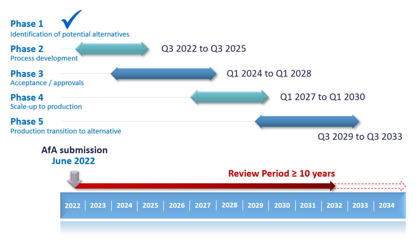
Figure 3: Substitution roadmap for plating (use 2)

Some of these timescales involve variable periods of time, e.g. because of different sectoral requirements or where it is not certain how long a particular phase might take. In order to achieve a suitable balance between 'best-case' and 'worst-case' scenarios, Figure 3 depicts the phases overlapping where appropriate. This demonstrates that, even taking uncertainties into account to a certain extent, there is good justification that a review period of at least 10 years is needed until substitution of chromium trioxide in electroplating can be achieved.