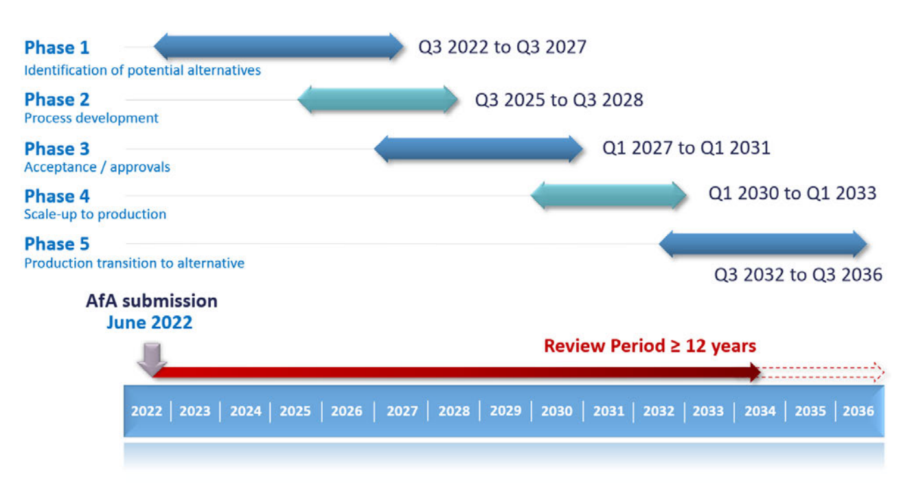
Figure 4: Substitution roadmap for etching (use 1)

The largest market for the applicants in terms of products that require an etching pre-treatment, i.e. involving plastic substrates, is the automotive sector. The following discussion therefore focuses on the automotive sector in particular, although it must be borne in mind that the applicants produce chromeplated plastic products for a wide variety of other markets, such as sanitary ware, heating, brewery, domestic appliances, point of sale and electronic applications. This means that to successfully substitute chromium trioxide in etching, any potential alternative must prove suitable across the range of the applicants' products.